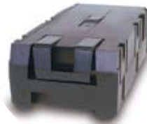
Battery module (two per slot)