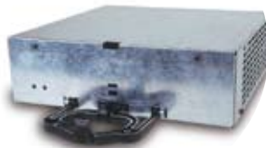
3 kVA power or charger module (one per slot)